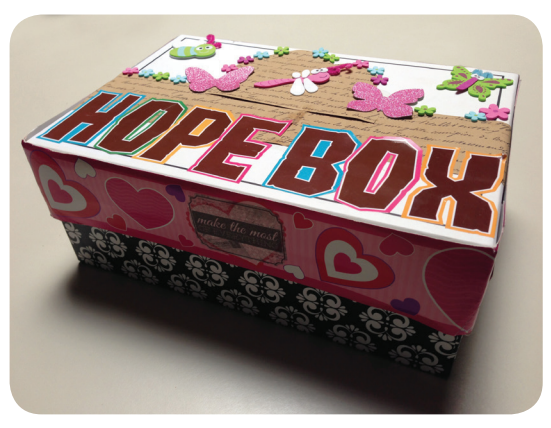
Hope box created by DHSPC support group participant